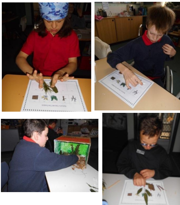
3LB - Examined Parts of a Tree and Made a Diorama