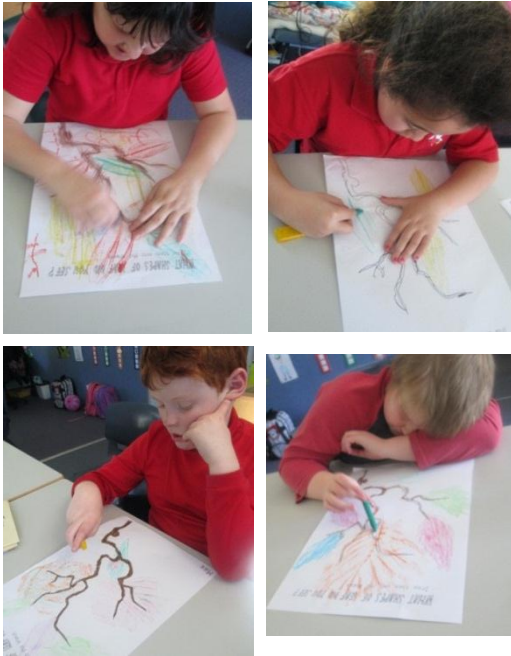
6PL - Leaf Rubbings

Last Friday the students at Newcastle Middle school participated in a variety of activities to celebrate National Tree Day. It was wonderful to see our students finding out about the environment and connecting with the amazing trees that make up our beautiful world.