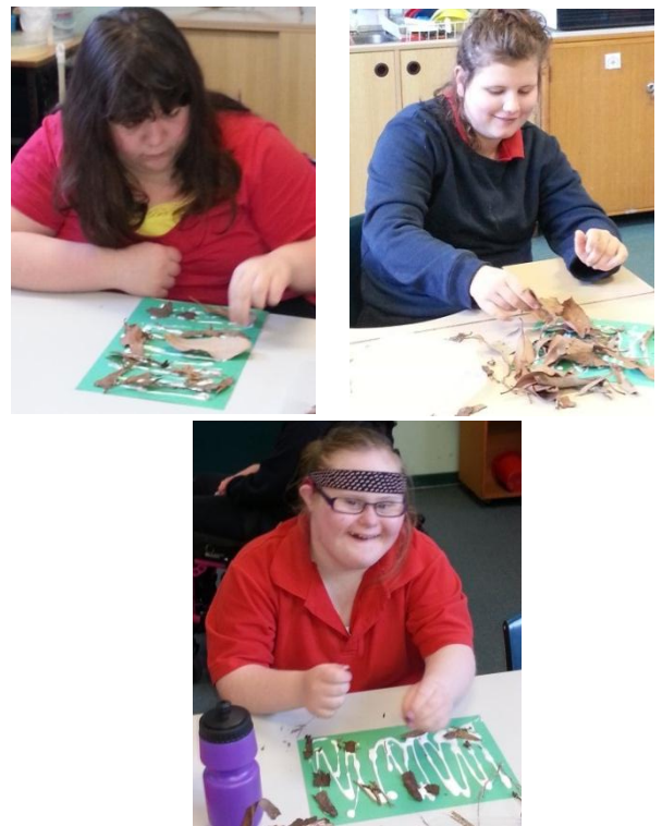
2VK – Tree Collages