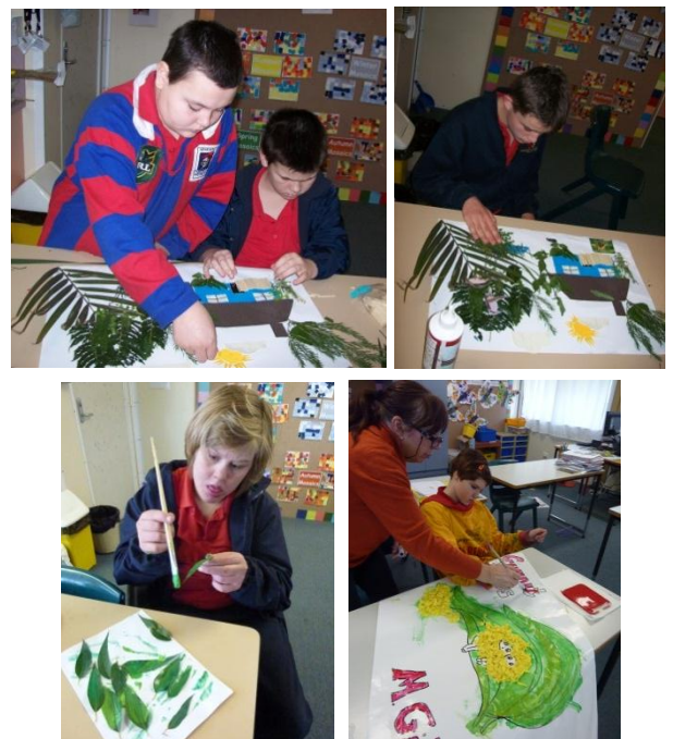
5JM - Making Pictures using Tree Components

Thank you to all the classes who participated in this very important day here at Newcastle Middle School.